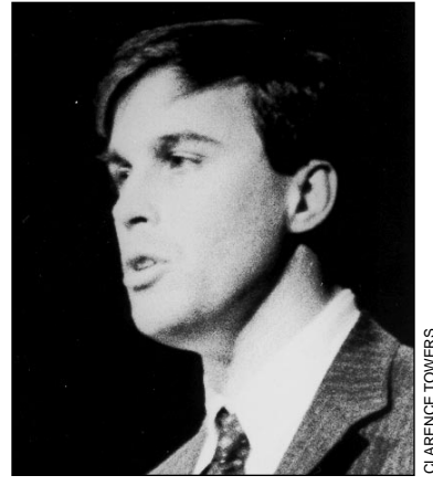
"I expect that, when the PA-8000 begins shipping in systems, it will outperform all competitive RISC systems at that time."

To avoid the taken-branch penalty, the PA-8000 includes a branch target address cache (BTAC) similar to that in the PowerPC 620 ( see 081402.PDF ). This fully associative 32-entry structure is accessed along with the instruction cache but responds in a single cycle. If a branch instruction is predicted taken and is found in the BTAC,